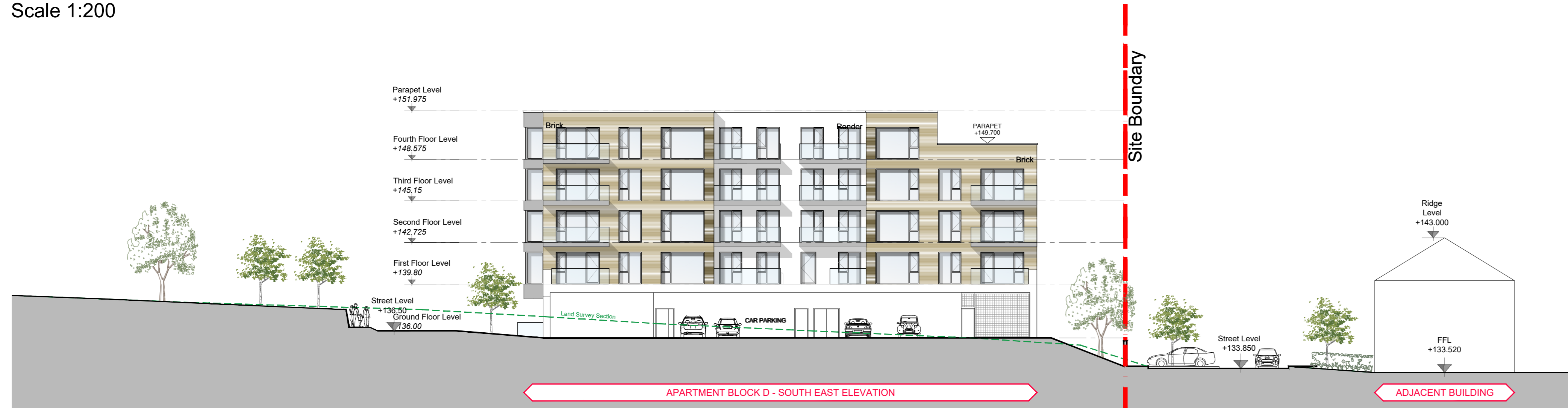
SITE SECTION BB Scale 1:200