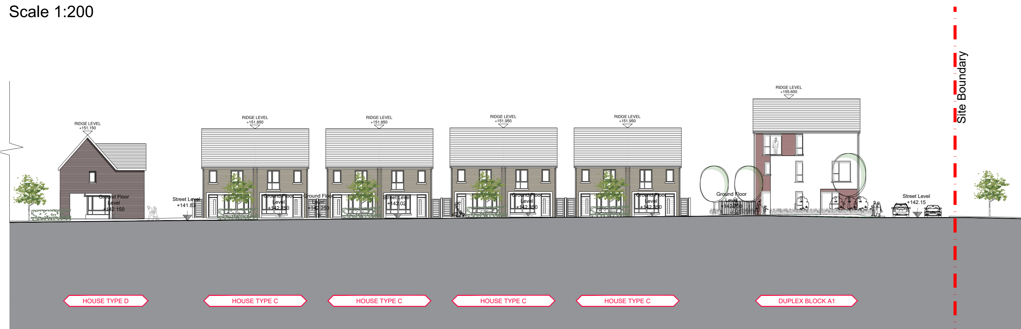
SITE SECTION CC - Right Side Scale 1:200