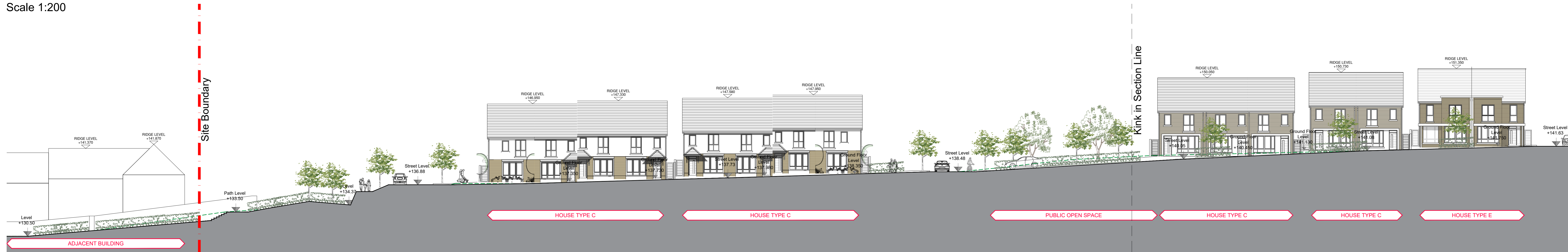
SITE SECTION CC - Left Side Scale 1:200