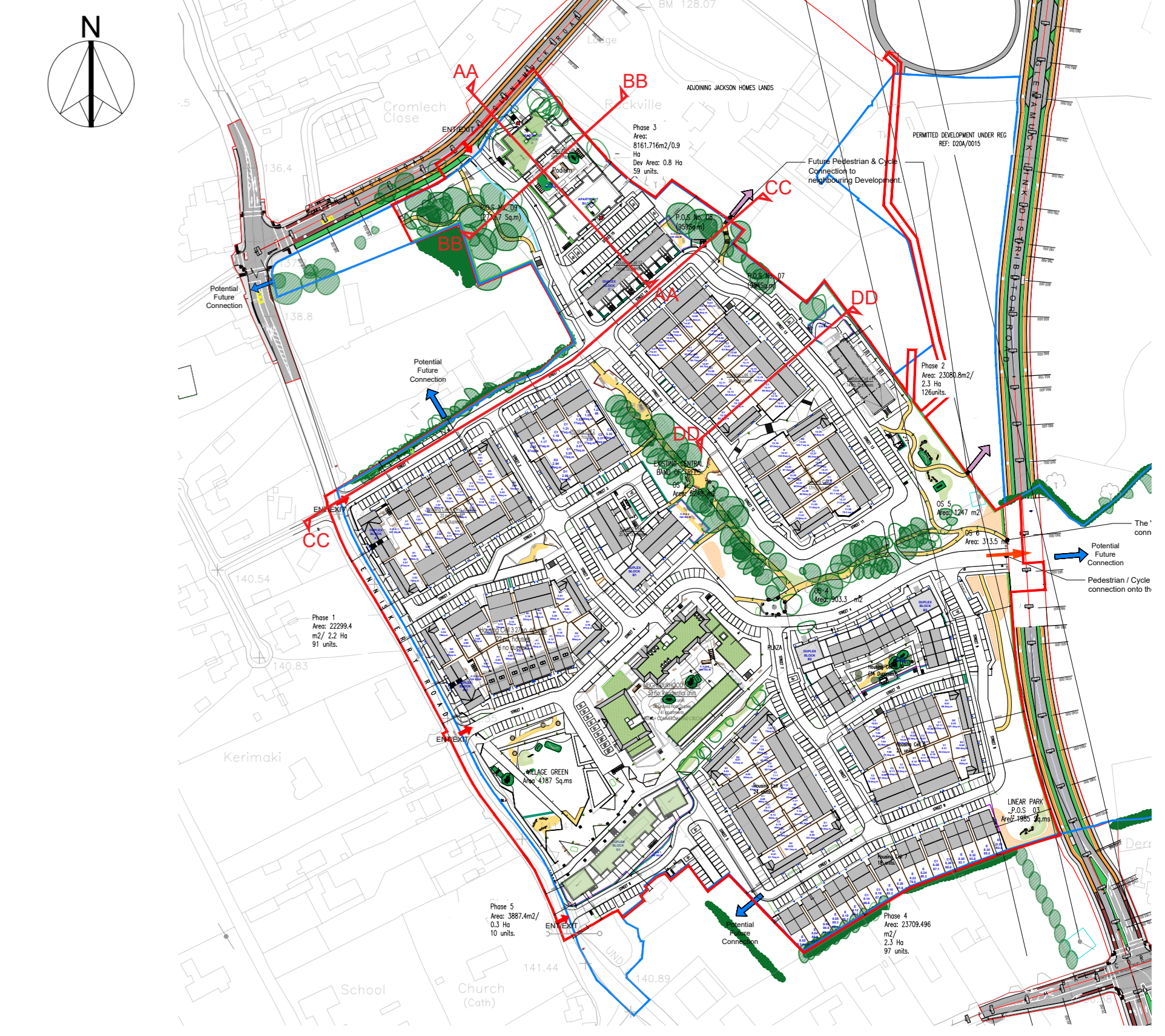
KEY PLAN - NTS